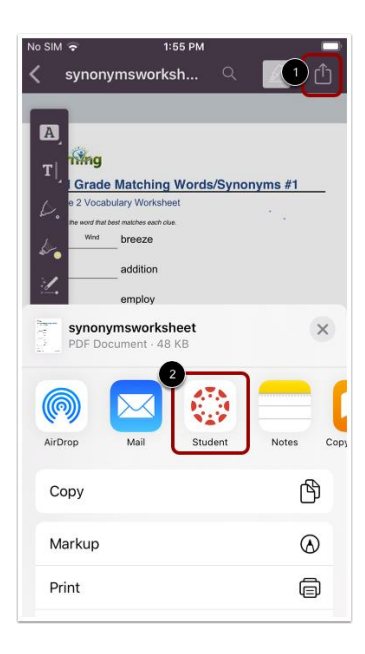
Step 8: Click submit

Step 7: To submit assignment, 1. Click on the share icon at the top right corner (next to edit icon) and 2. Click on the Student Canvas icon.