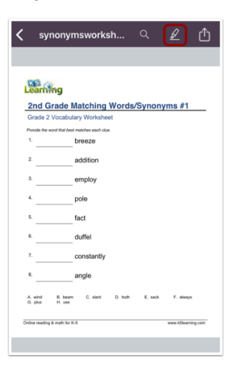
Step 6: View tool bar with accessories available for editing document

Use the toolbar to select your annotation tools.